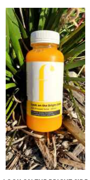
LOOK ON THE BRIGHT SIDE