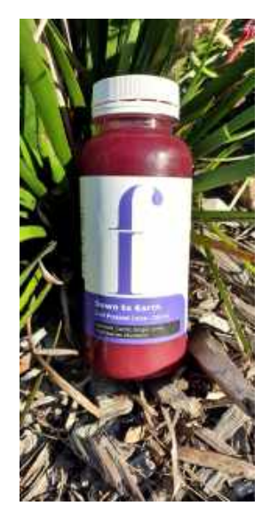
DOWN TO EARTH