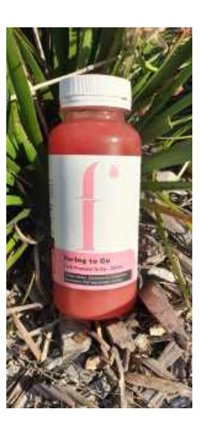
RARING TO GO