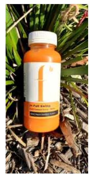
IN FULL SWING