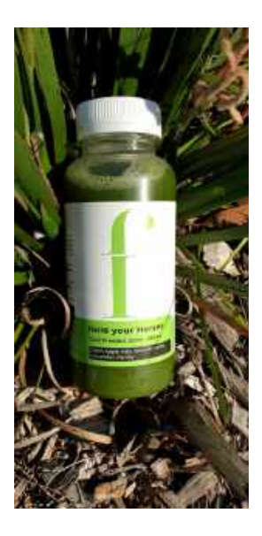
HOLD YOUR HORSES